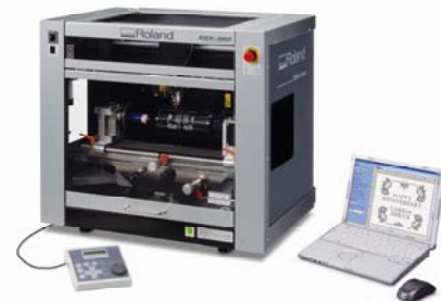
Computer not included

The New Roland EGX-360 Gift Engraver MSRP: $17,995.00